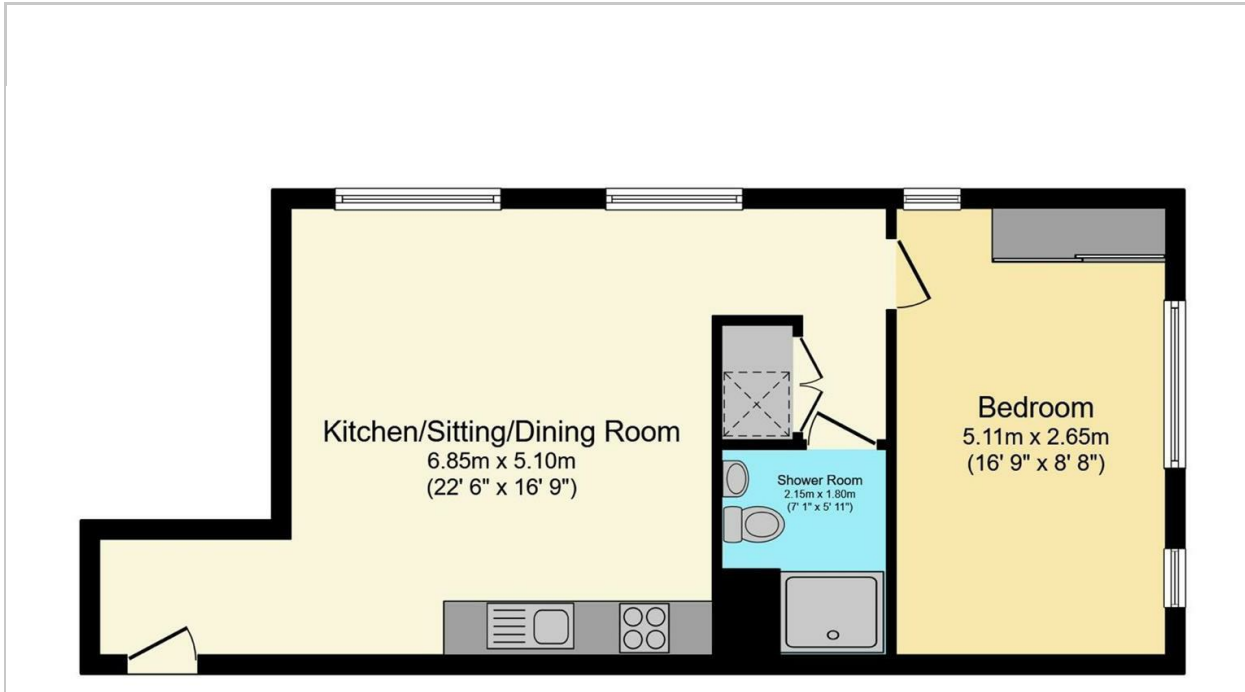
Floor Plan Floor area 51.2 sq.m. (551 sq.ft.) approx

Total floor area 51.2 sq.m. (551 sq.ft.) approx